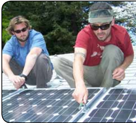
Ukiah Greenworks PV 200 Design & Installation Intensive class

Solar jobs forecast to grow 50% in 2012 Our graduates get jobs in Solar!